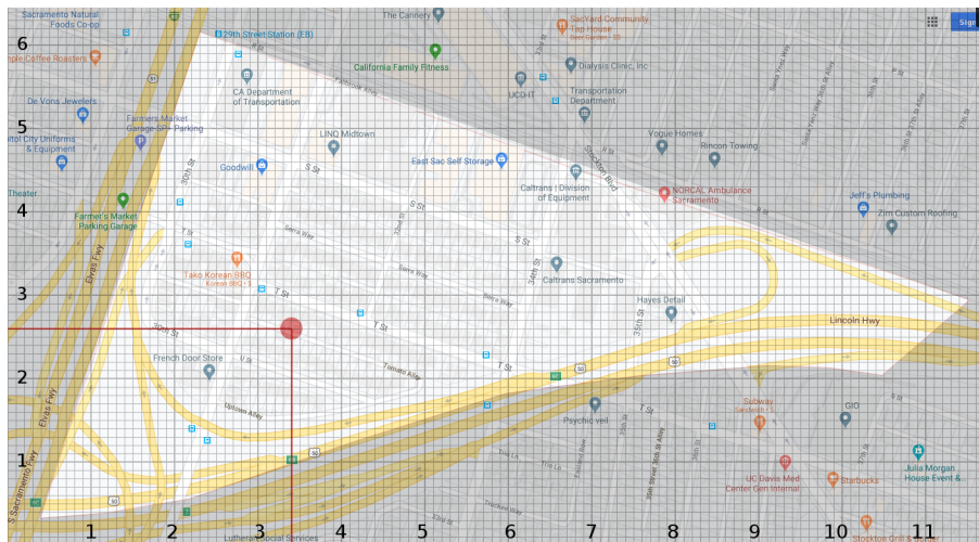
Map generated by Google

If the random location is within the Alhambra Triangle area, then we mark the location on the map, as seen above. If the random location is outside of the highlighted area, or overlaps with a formerly chosen location, then we discard both coordinates and roll again.